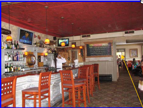
The "before" & "after" —of SCJPAR gathering spot of the clan...

Presumably one of the best turnouts ever since it began. Put the next date on your calendar and plan on being there on Thursday, July 16 th , to be held outside at the Tiki Bar (weather permitting). Hope to see you all there.